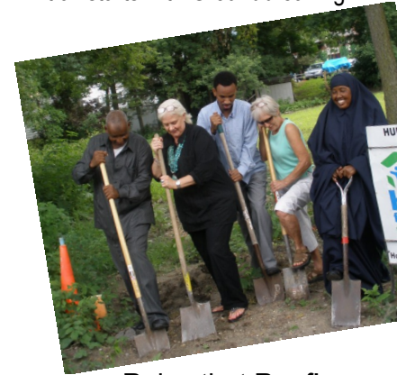
Raise that Roof!